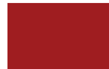
721 Relay Red