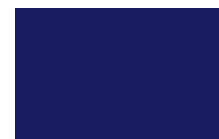
717 Grand Slam