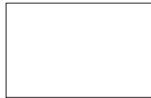
714 Snow White