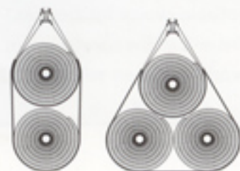
Two mats in two slings (Vertical)