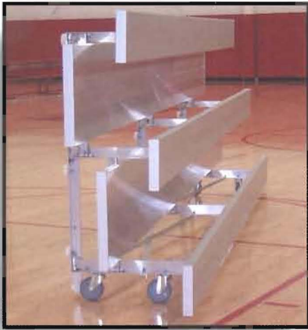
3 Row Tip N' Roll Preferred

The perfect solution to your auxiliary seating needs.