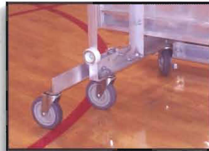
4 Row Tip N' Roll w/Outrigger

Safety outrigger with casters are included on 4 row models for added stability when tipped up for movement.