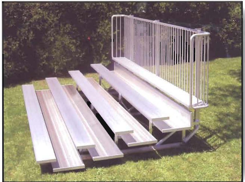
5 Row Low Rise Preferred

All bleachers should be anchored to resist wind loads. Please contact your local code authority for compliance with your applicable codes.