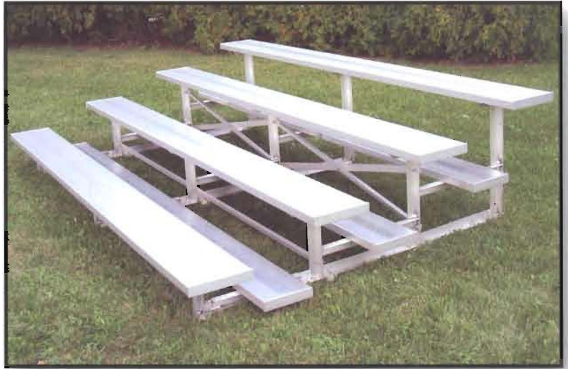
4 Row Low Rise Standard