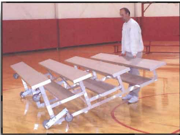
4 Row Tip N' Roll Standard