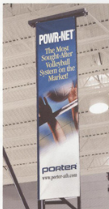
Enhance Your Overhead Volleyball System with a Custom Graphic Banner!

For assistance designing your floor plan and space requirements in your new or existing facility, contact Porter or your nearest Porter Dealer.