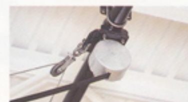
Saf-Strap® for Added Safety