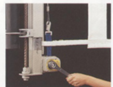
Powr-Winch® Net Tensioner (Shown with padding removed)