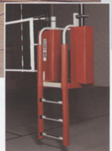
Optional Judge's Stand Provides an Unobstructed View of Court